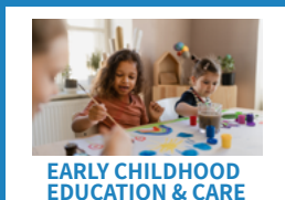
EARLY CHILDHOOD EDUCATION & CARE