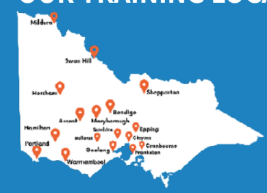
OUR TRAINING LOCATIONS